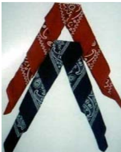
Colors and Symbols

Notify your local law enforcement agency or the Washington County Sheriff's Office Interagency Gang Enforcement Team, or the Washington County Juvenile Department.