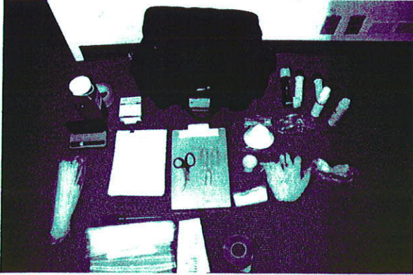
Fig. 1 - Search Bag