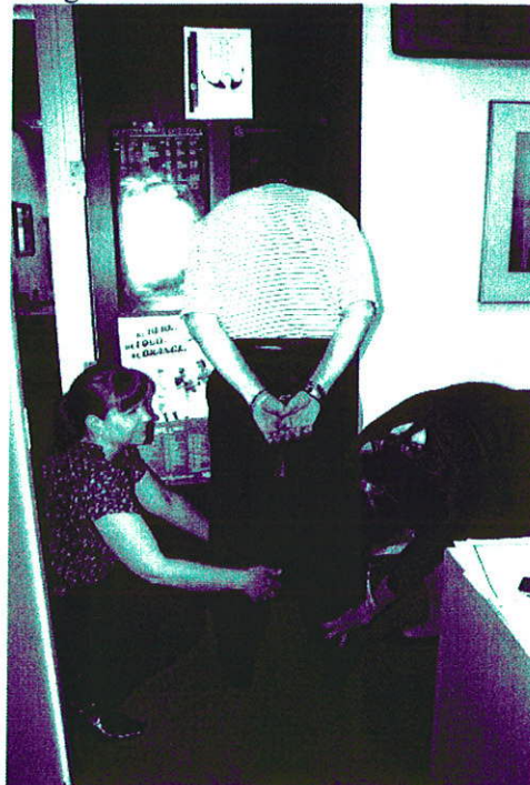
Fig. 6 - Performing a search on a client