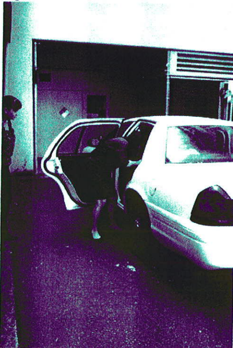
Fig. 5 - Leaning in to secure the seatbelt for a handcuffed client during transport