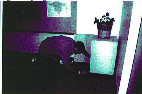
Fig. 4 - Searching Premises