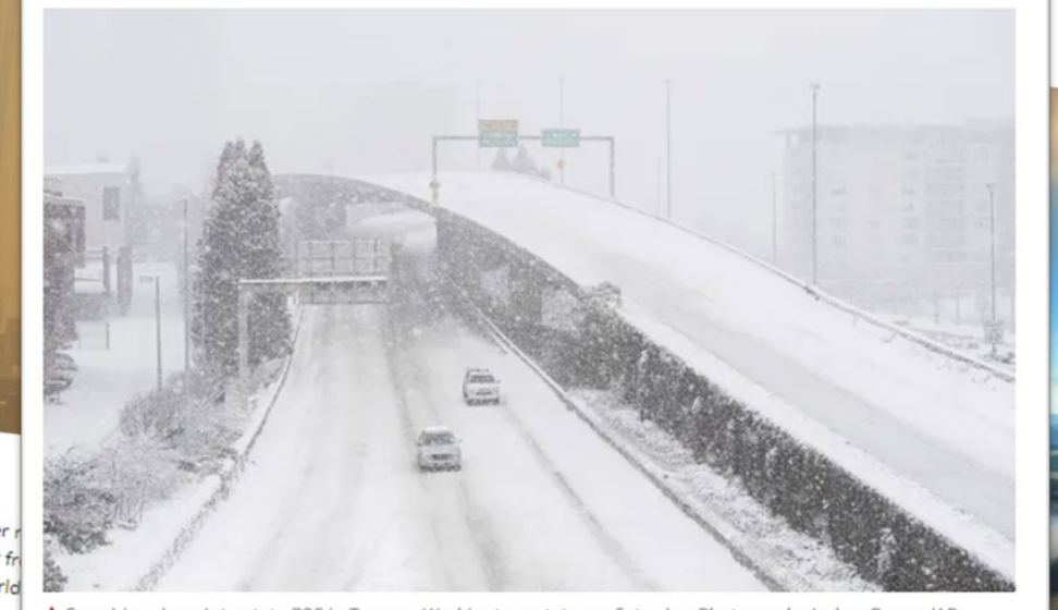
▲ Cars drive along Interstate 705 in Tacoma, Washingtons state, on Saturday.

Hundreds of thousands of people remained without power in the Pacific north-west after a winter storm blanketed the region with ice and snow and made travel treacherous.