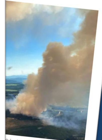
Columbia on June 30. BC Wildfire

ord-breaking heat found that it ible without the influence of