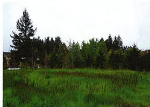
East Council Creek Natural Area

Over the past 25 years, voters have made this mission a reality by approving two bond measures to purchase natural areas – and, in 2013, a levy to care for this growing portfolio of land. All three voter investments have called for public access as an important part of Metro's work.