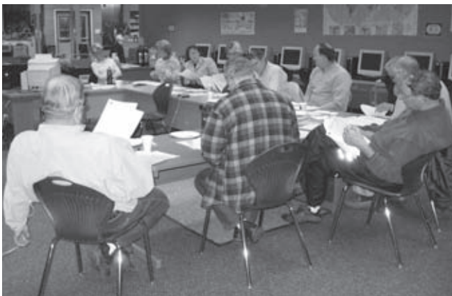
Policy Advisory Board

Washington County Office of Community Development wishes to acknowledge and thank the hundreds of community members, government representatives, and non-profit and agency staff who participated in meetings, surveys, interviews and focus groups related to this plan.