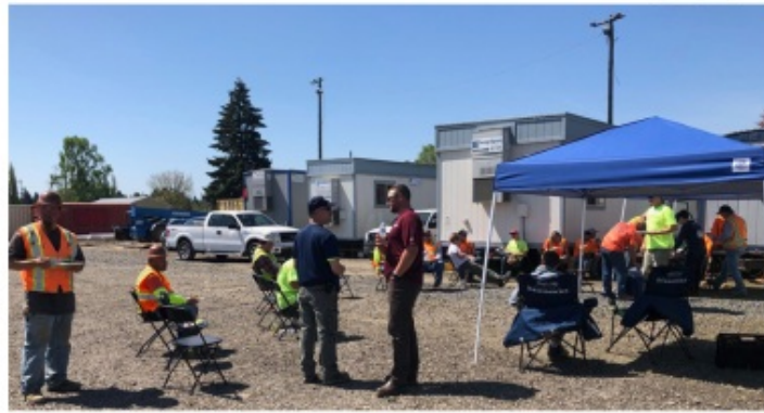
Project trade partners enjoy a safety barbeque to celebrate a perfect safety record on the project so far.