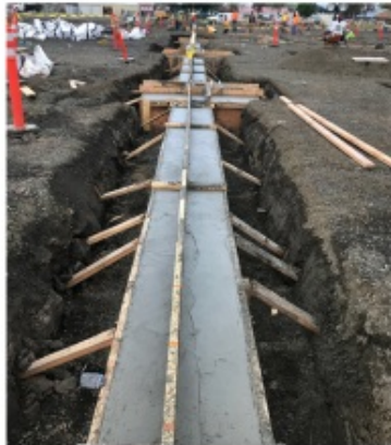
- Concrete foundation being poured and finished- Over 900 cubic yards total!