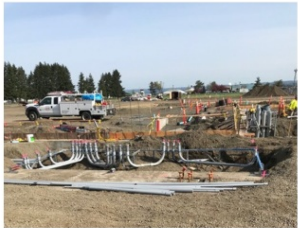
Plumbing, electrical, & gas underground installation at the kitchen