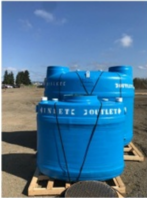
Pump station plumbing arriving on site