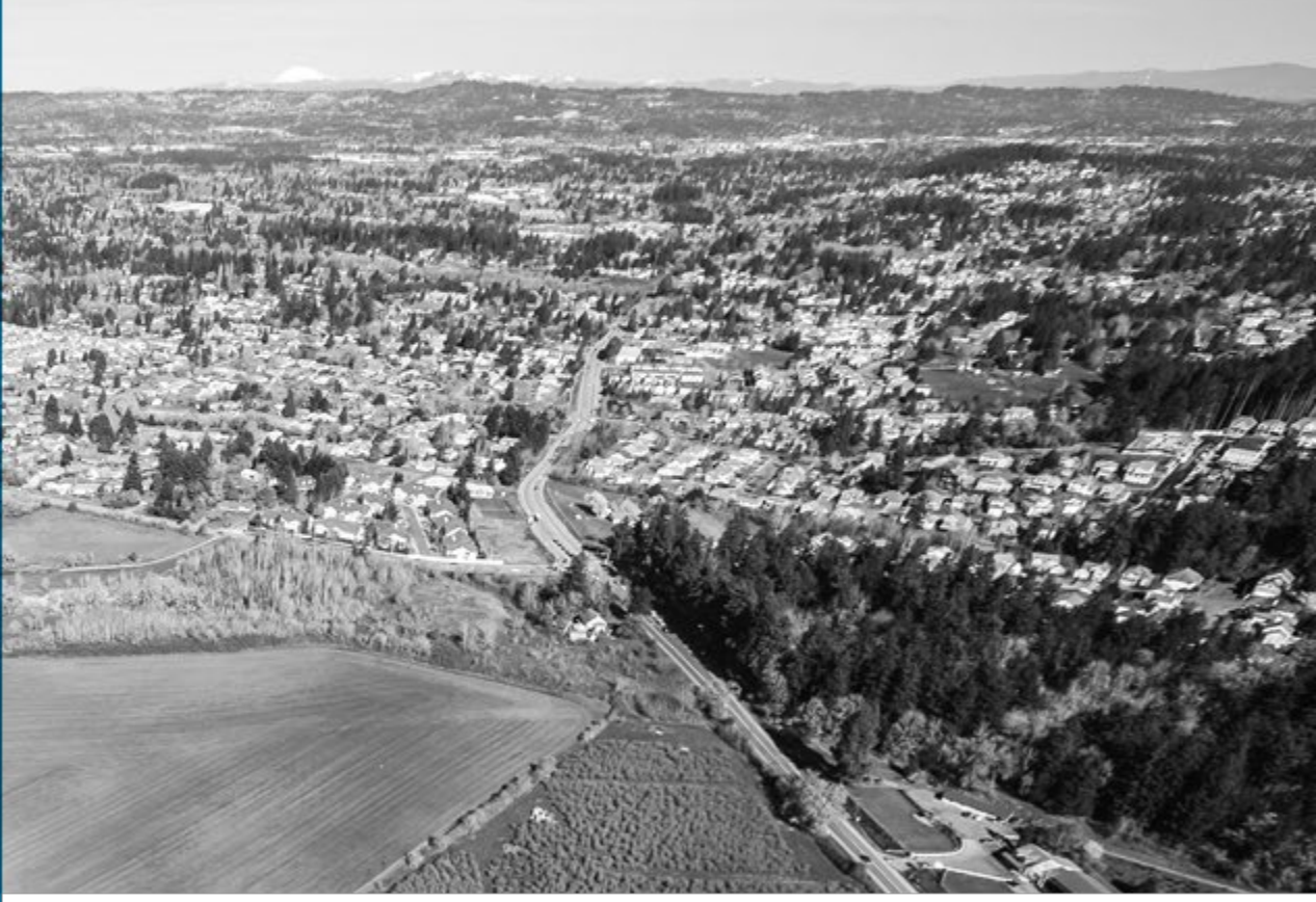
January 21, 2020

2021 State and Federal Legislative Agenda Presentation to Homeless Plan Advisory Committee