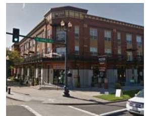
Chamfered corner & cornice feature