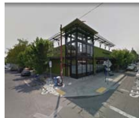
Taller height & cornice feature