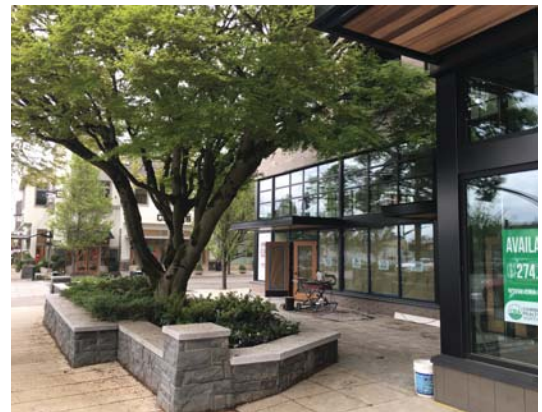
Usable open space where building doesn't occupy site frontage