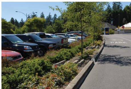
Parking and loading behind building

County screening and buffering standards apply where NCMU sites are adjacent to residential sites.