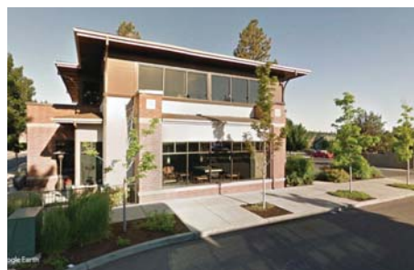
Parking and loading behind building