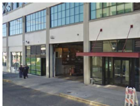
Internal loading area for building with structured parking