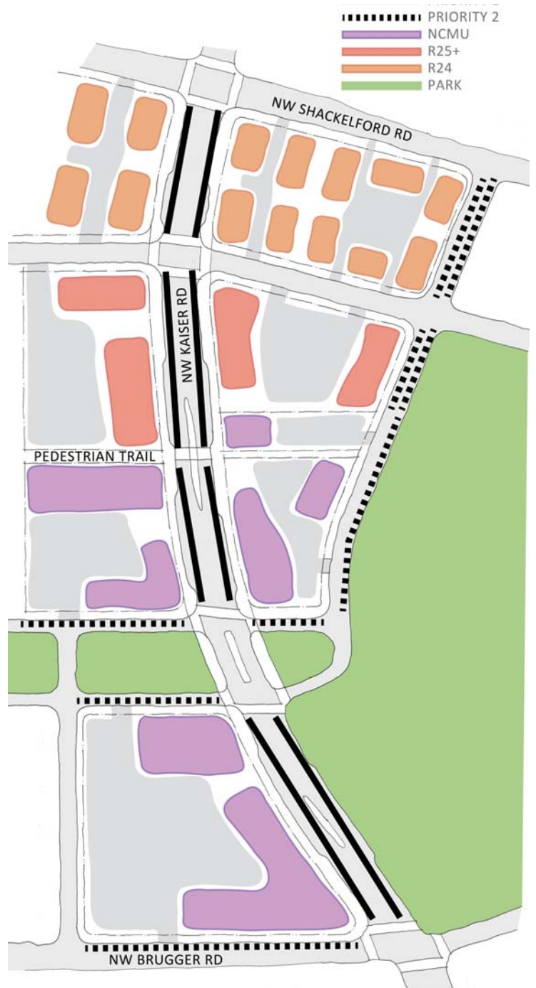
Kaiser Road is the Priority 1 street