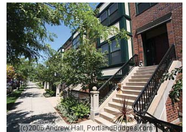
R-24 & R-25+: slightly larger setback for privacy