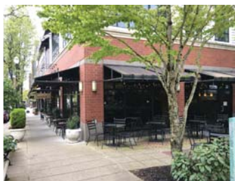
NCMU: small to no setback