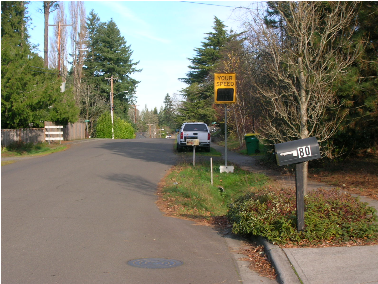
Speed Display Sign on 150 th Avenue