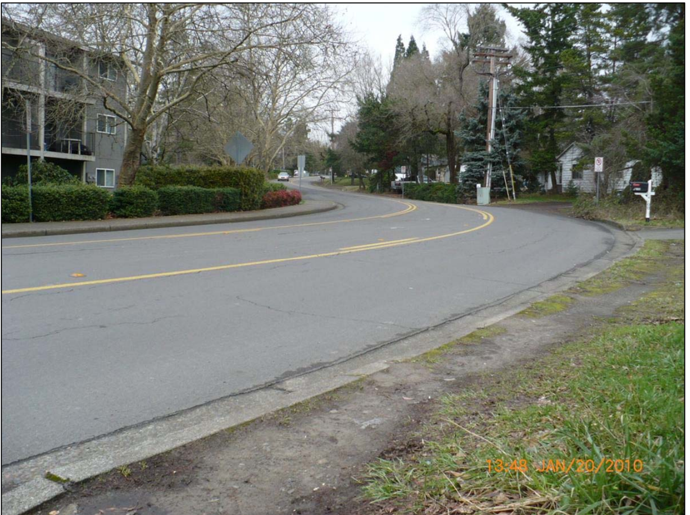
Butner Road near Walker Road looking north