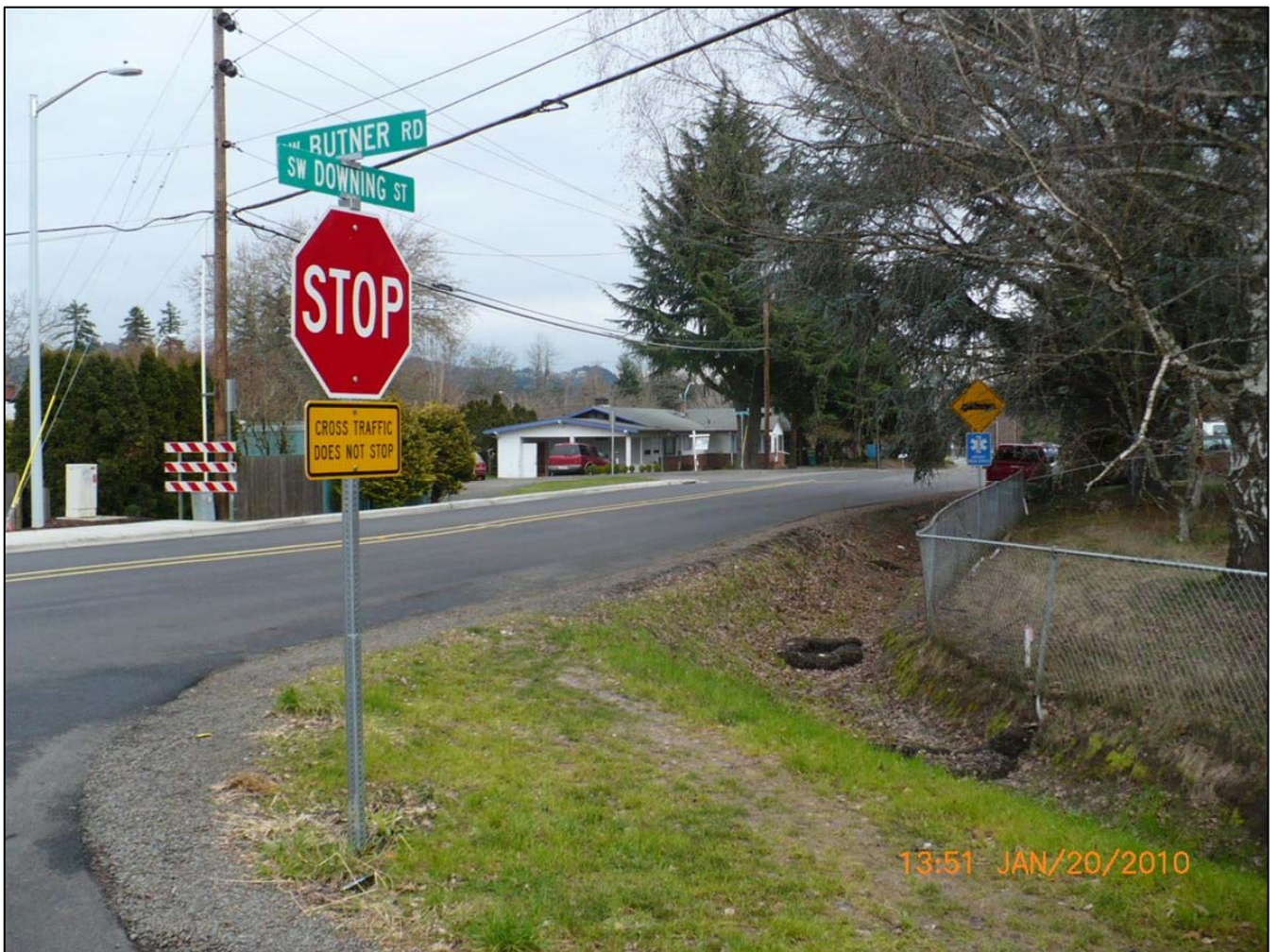
Butner Road at Downing looking east