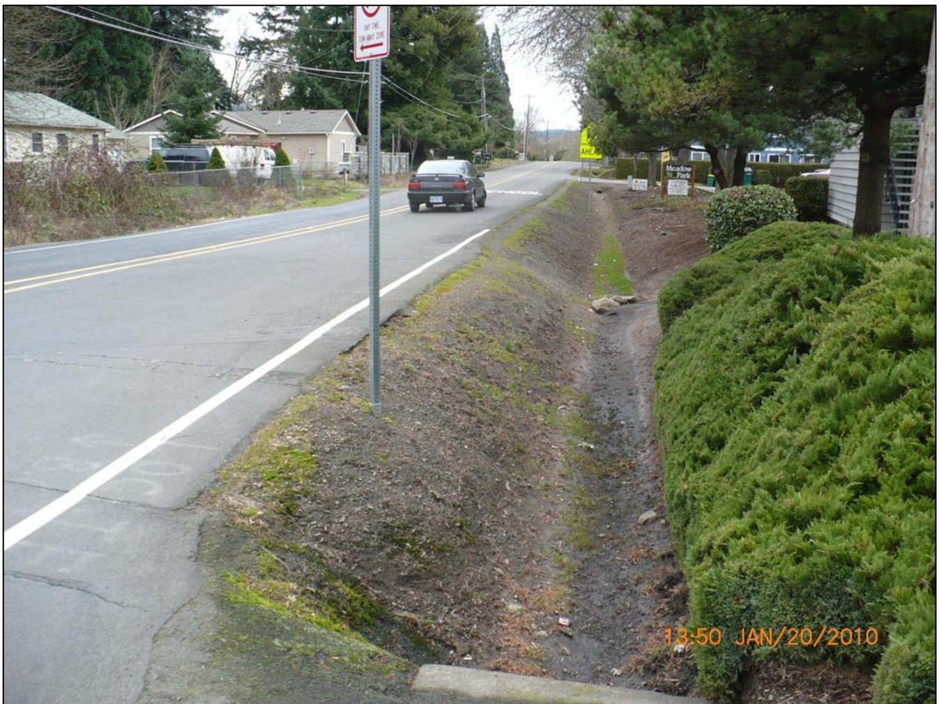
Butner Road at Downing looking south