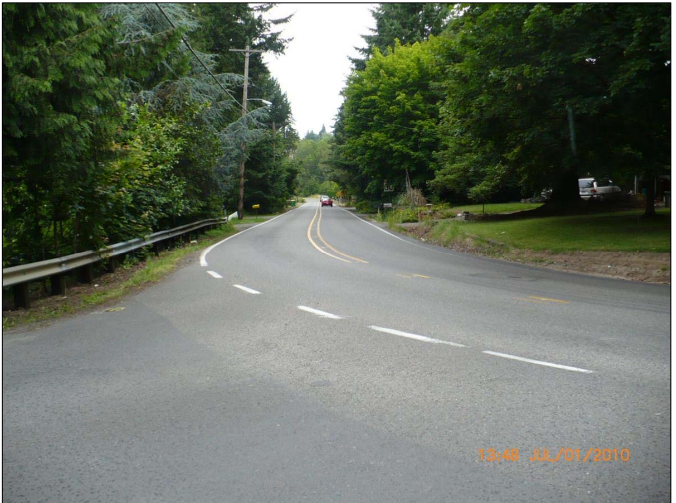
92nd Avenue at Garden Home looking north