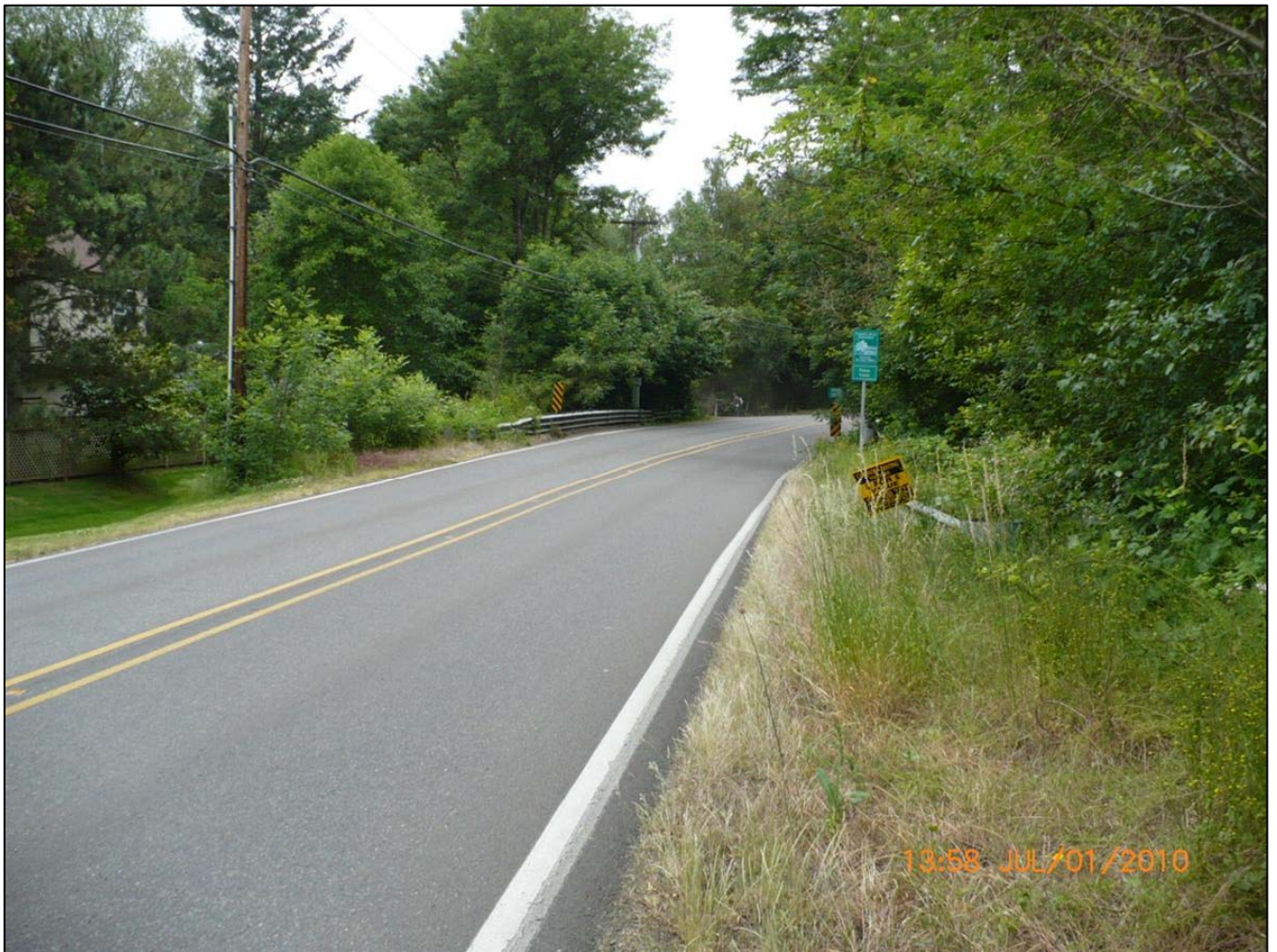
92nd Avenue at Bridge 1204 looking north