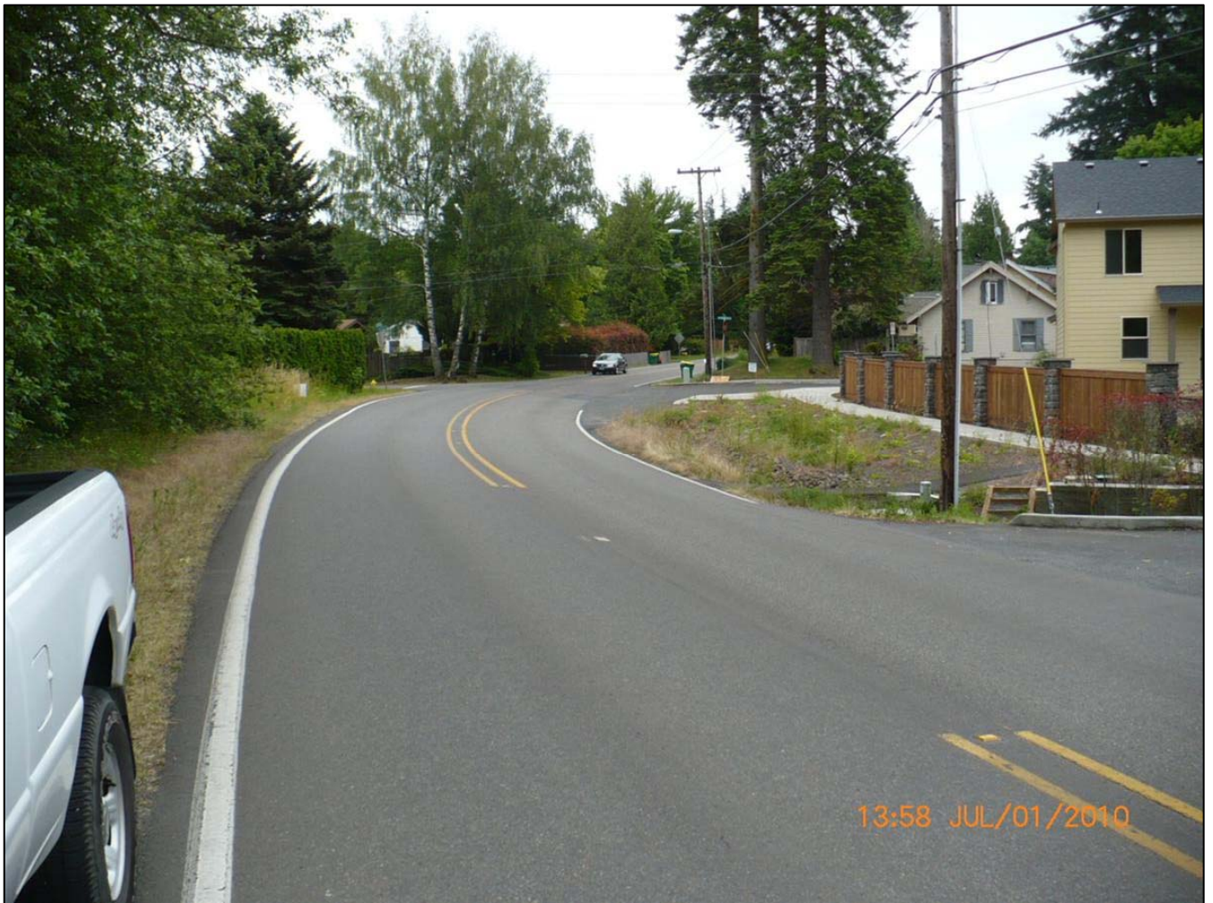
92nd Avenue at Bridge 1204 looking south