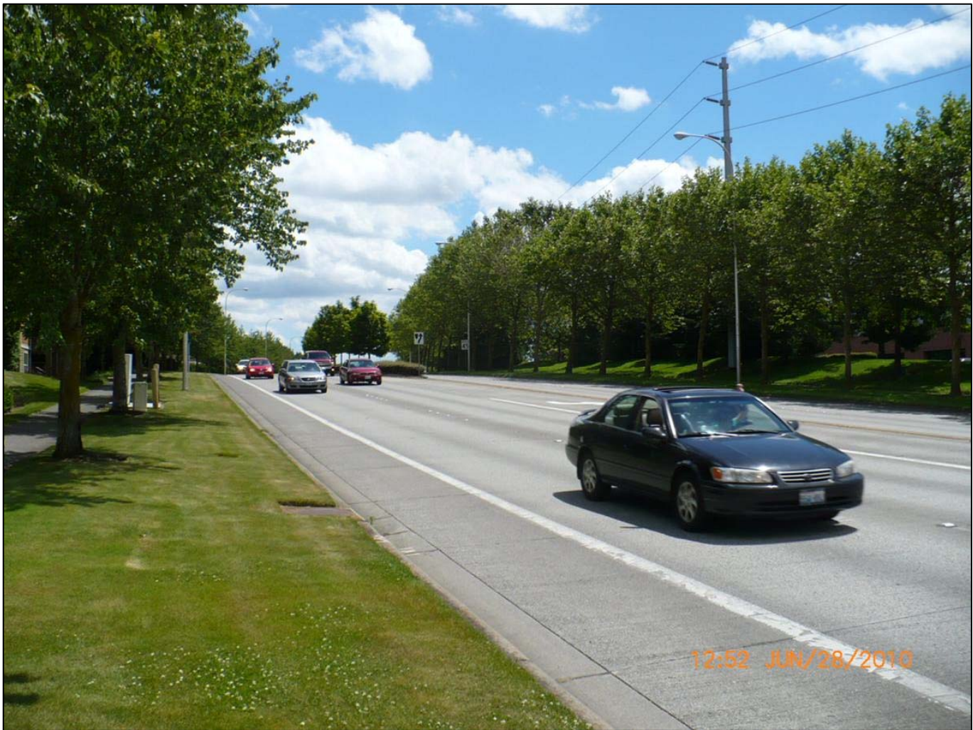
Cornell Road near John Olsen Avenue looking north