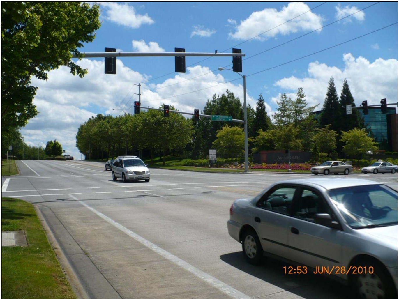
Cornell Road at John Olsen Avenue looking north