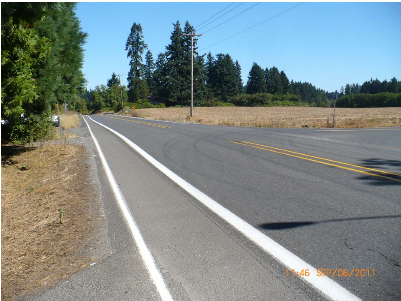
River Road at Rosedale Road looking south