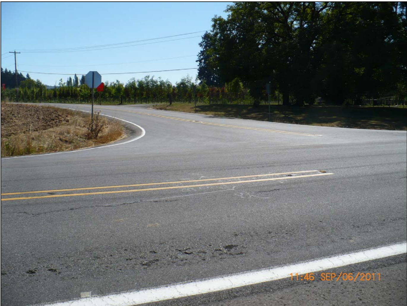
River Road at Rosedale Road looking east