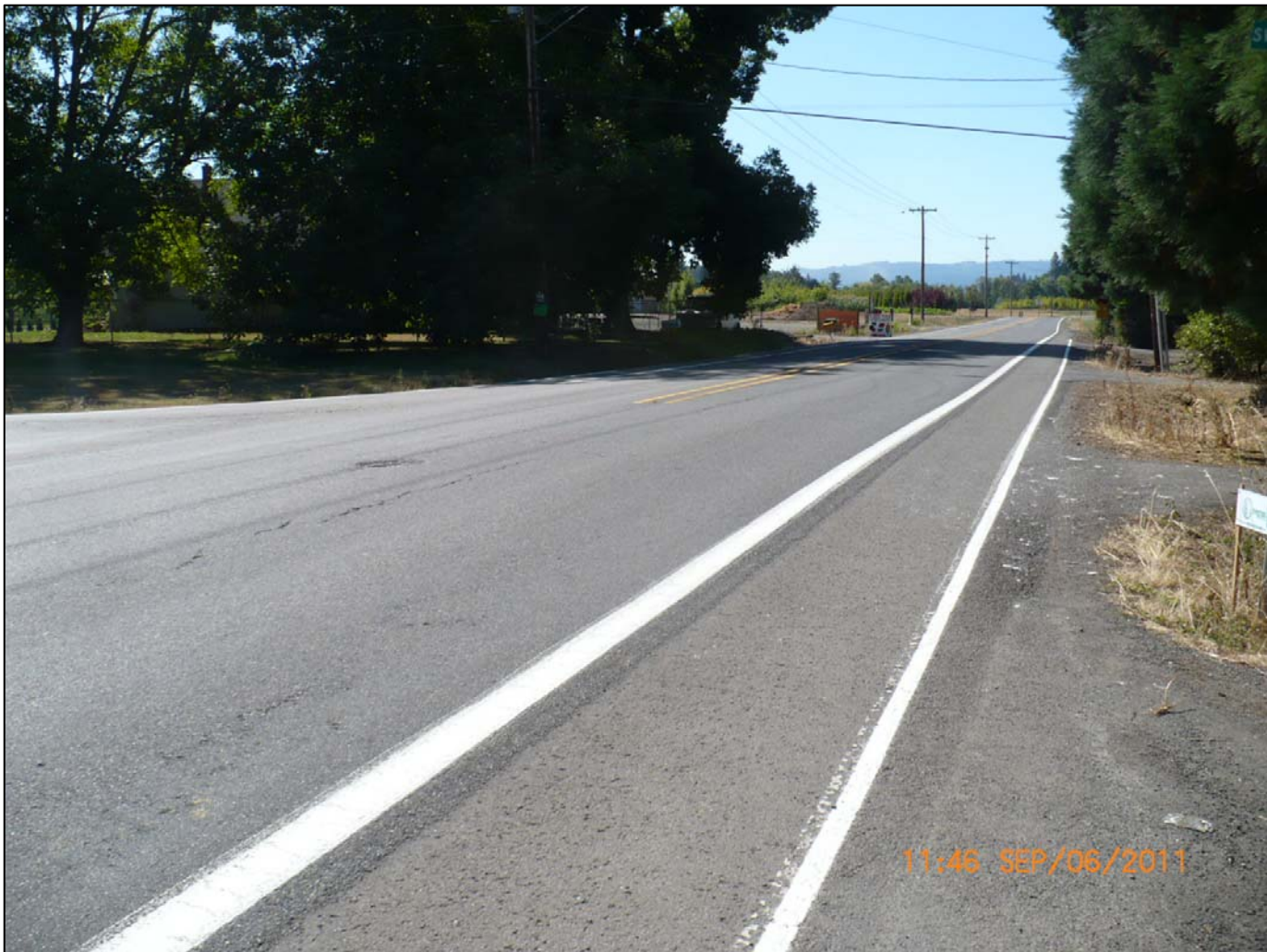
River Road at Rosedale Road looking north