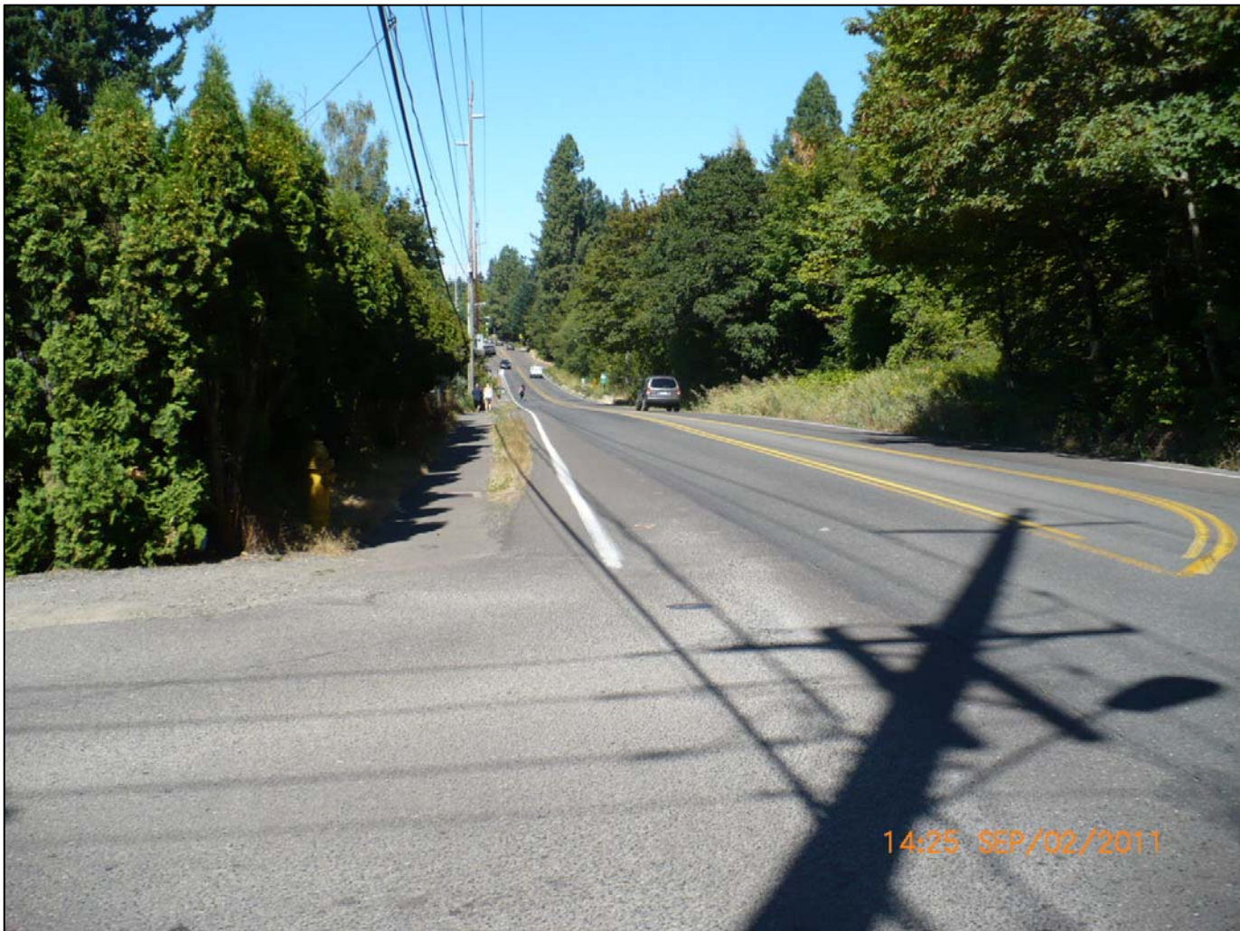
170th Avenue at Johnson Road looking north