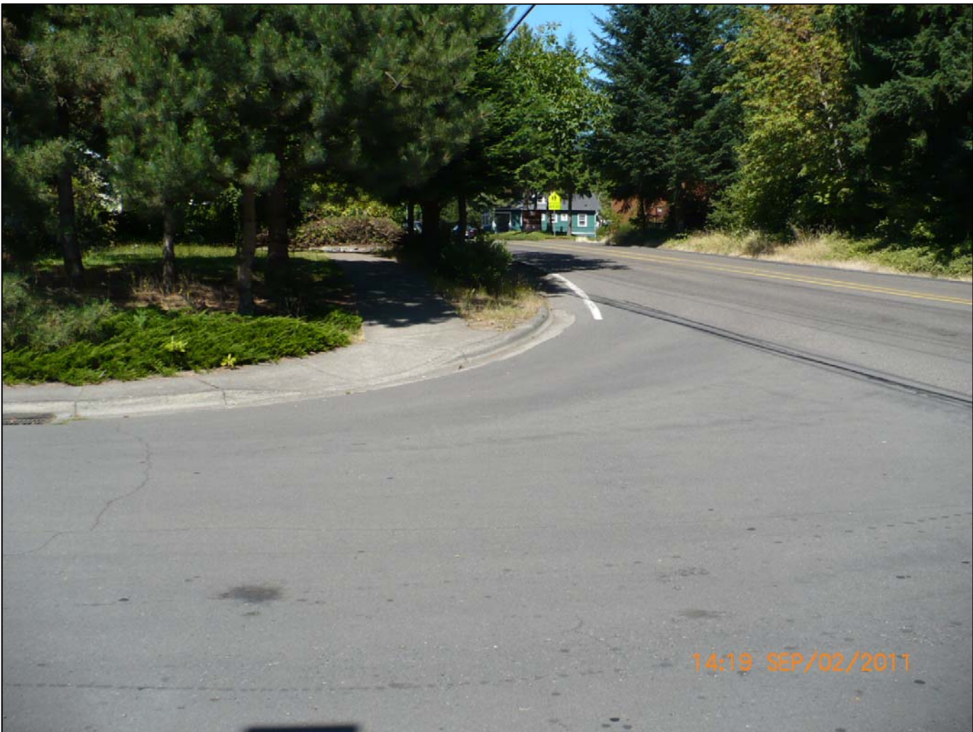
170th Avenue at Vendla Park looking north