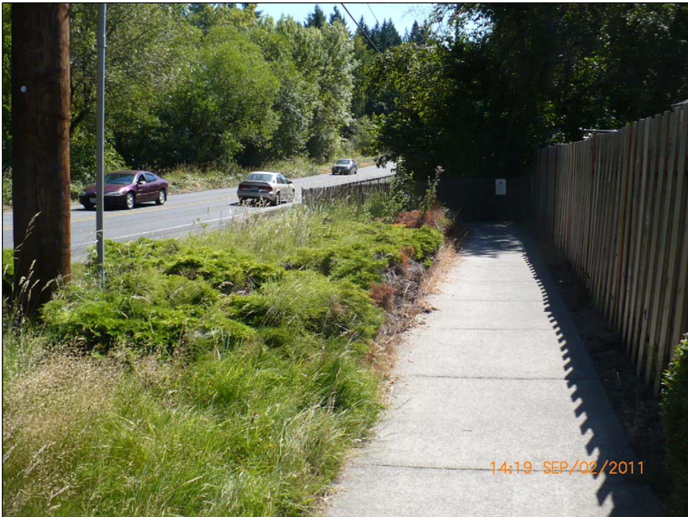
170th Avenue at Vendla Park looking south