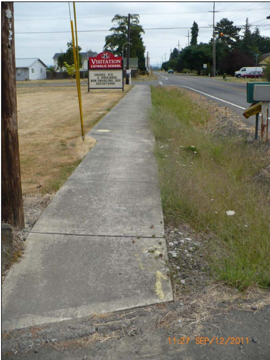
Verboort Road west of Visitation Road looking east