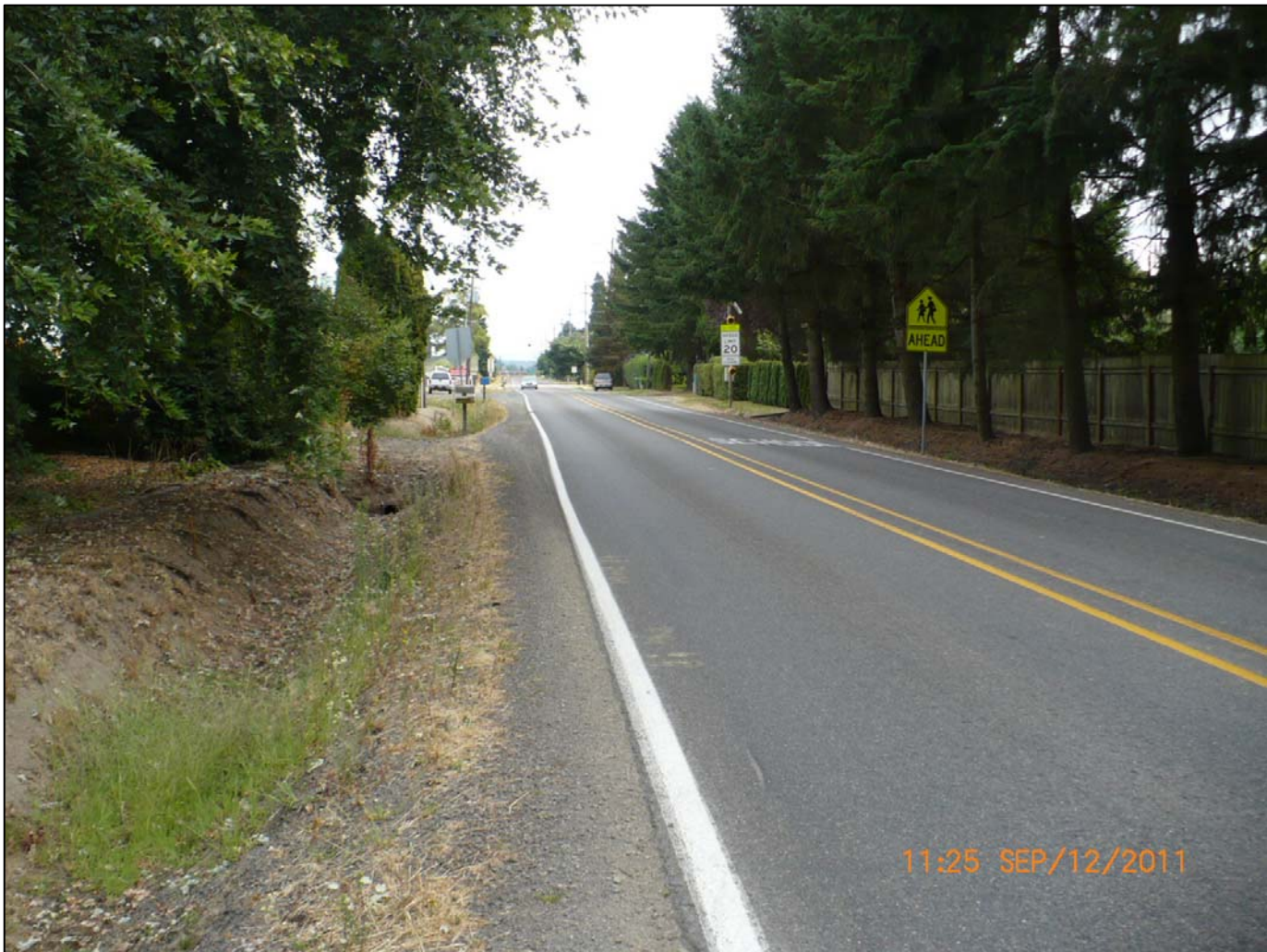
Verboort Road at Porter Road looking east