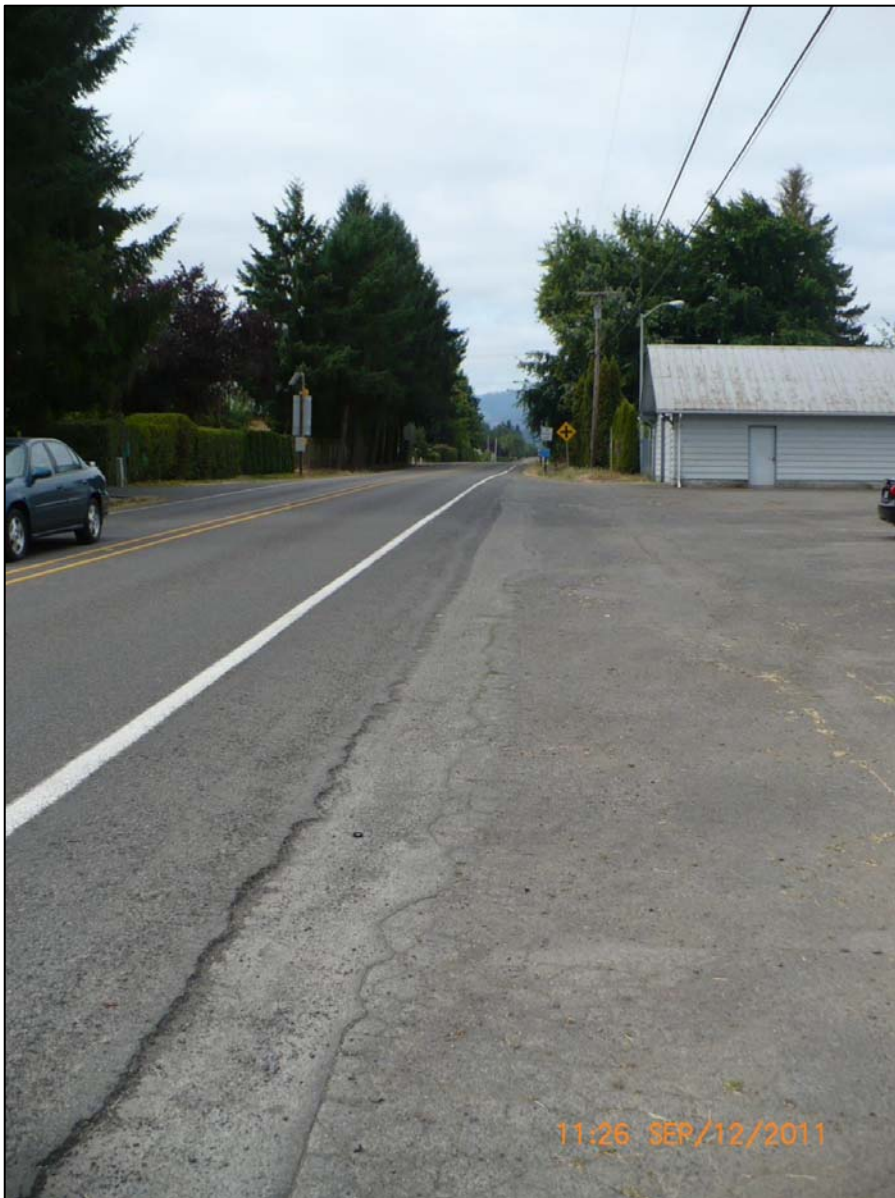
Verboort Road at Visitation Road looking west