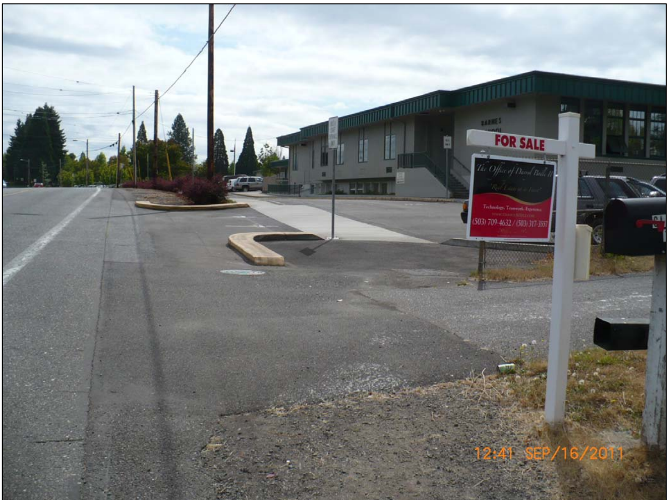
Walker Road at Barnes Elementary School looking east