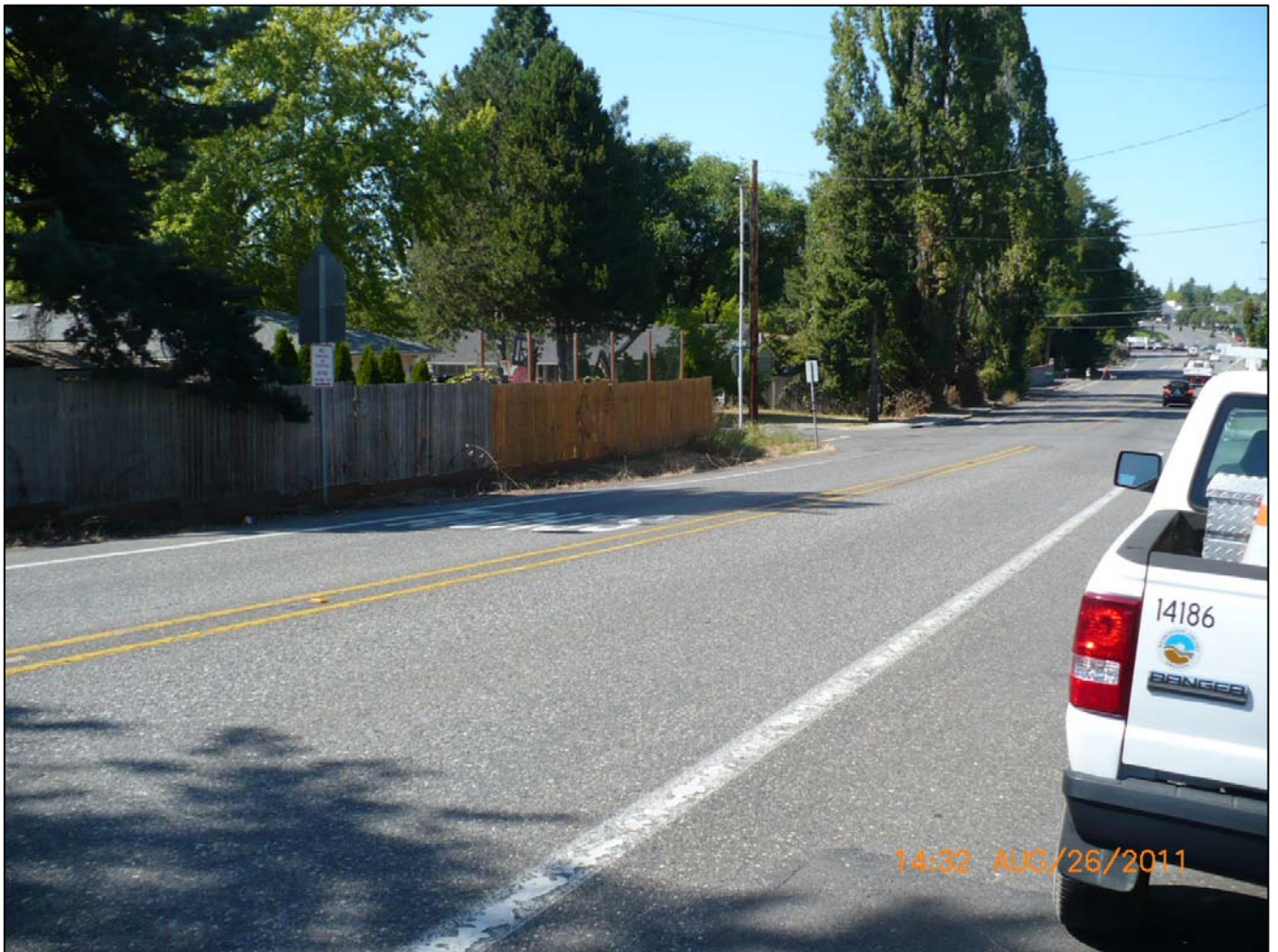
Walker Road near Barnes Elementary School looking west