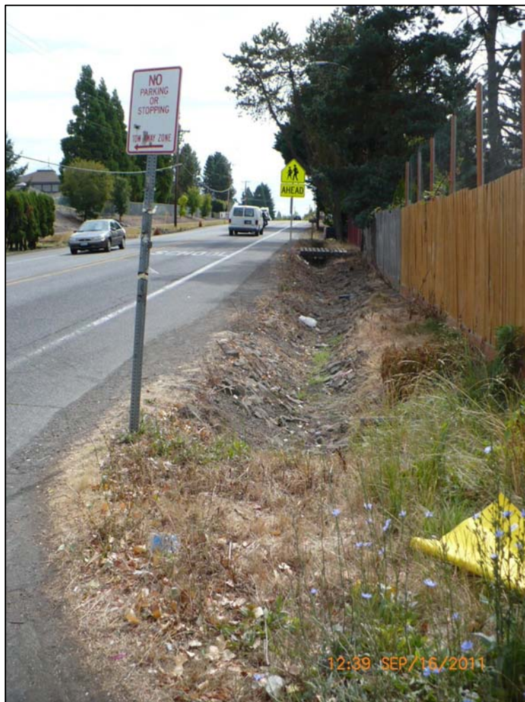
Walker Road at Furlong looking east