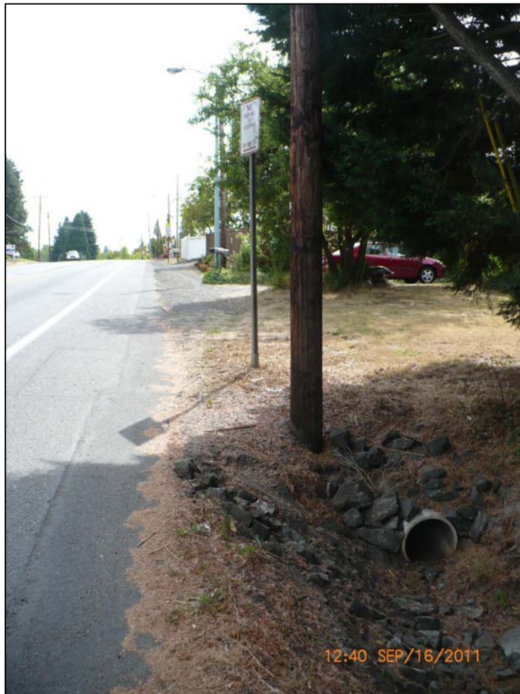
Walker Road near Furlong looking east