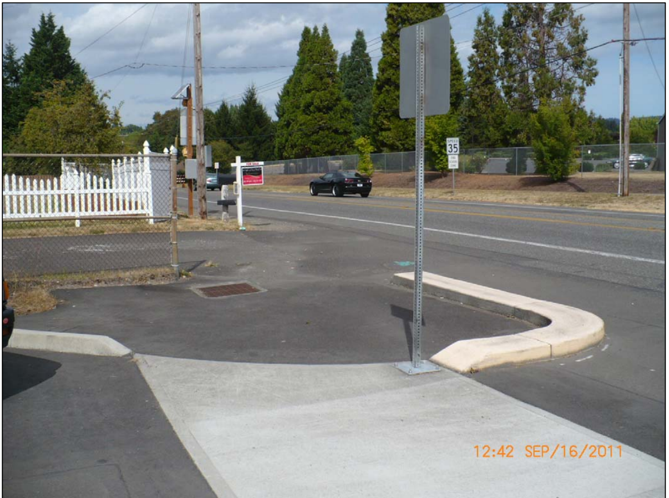
Walker Road at Barnes Elementary School looking west