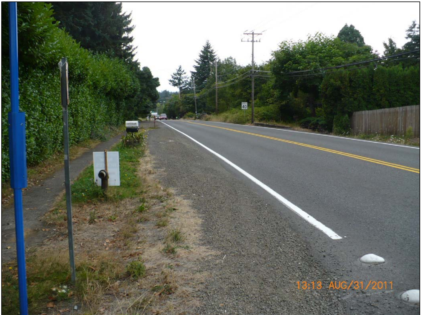
Cornell Road at 110th Avenue looking west