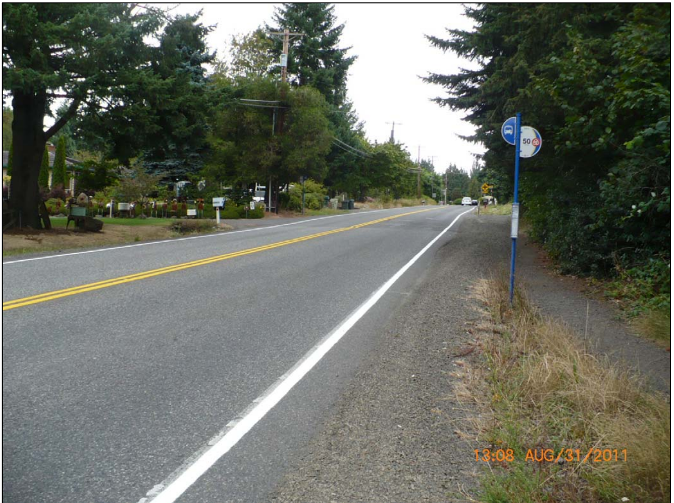
Cornell Road at 110th Avenue looking east