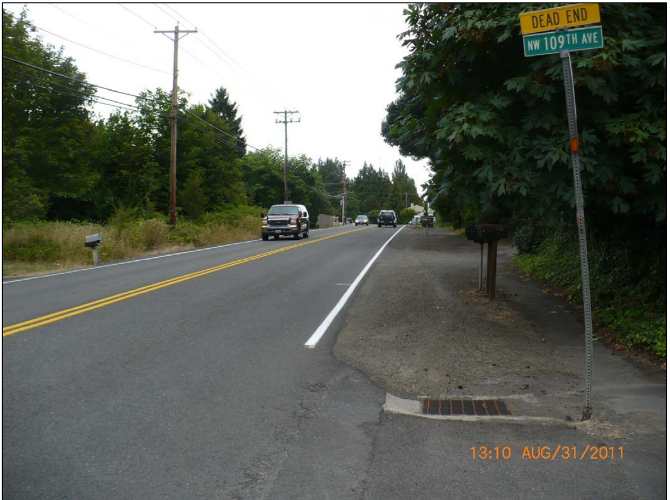
Cornell Road at 109th Avenue looking east