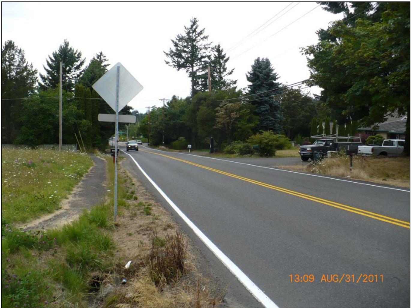
Cornell Road at 109th Avenue looking west