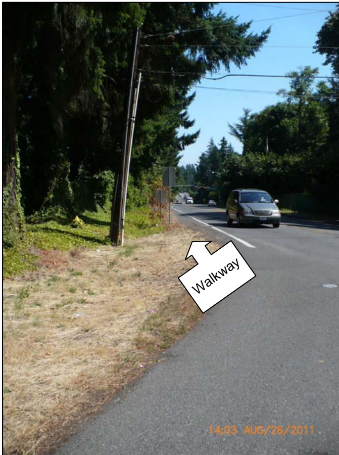
Walker Road at Lynnfield Avenue looking east