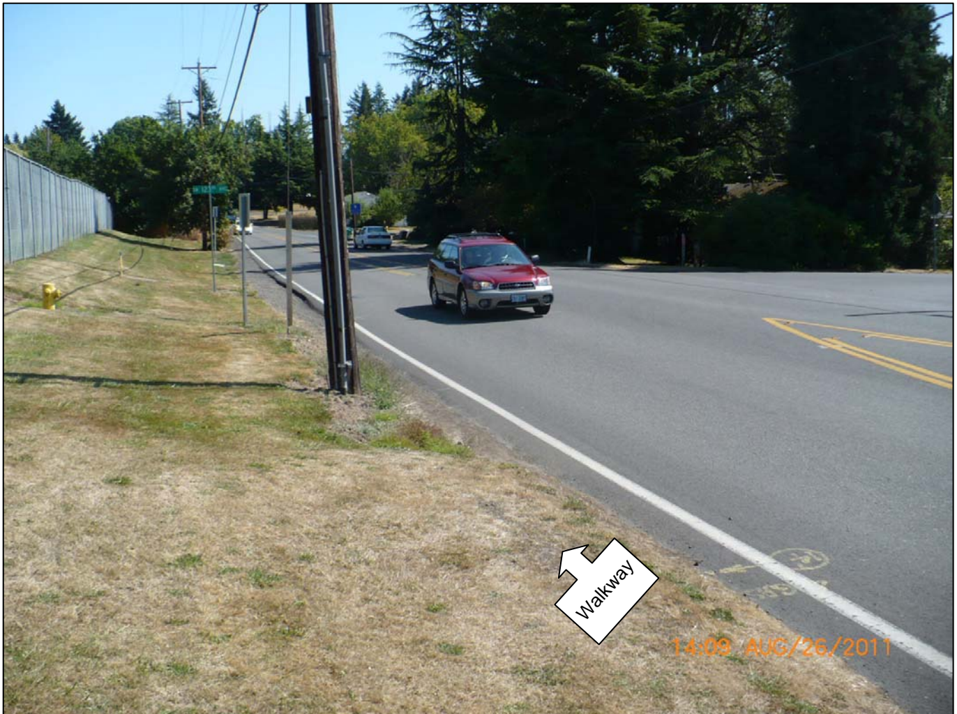
Walker Road at 123rd Avenue looking east