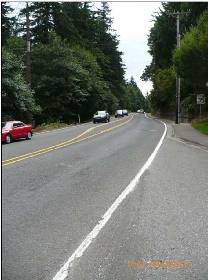
Barnes Road near Miller Road looking west