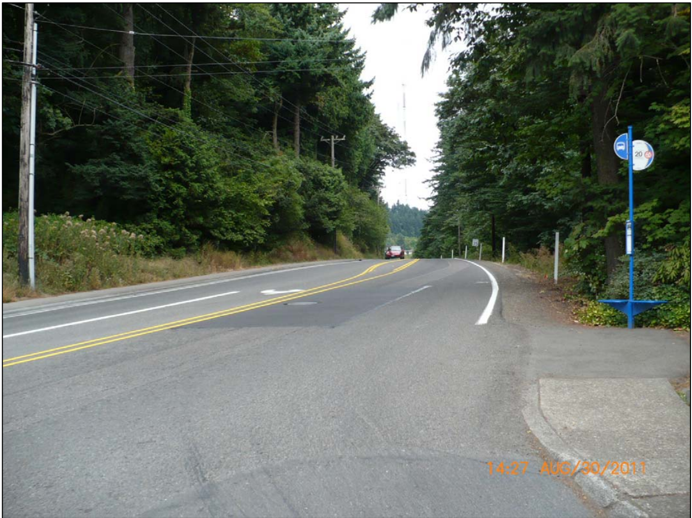
Barnes Road between Leahy and Miller looking east