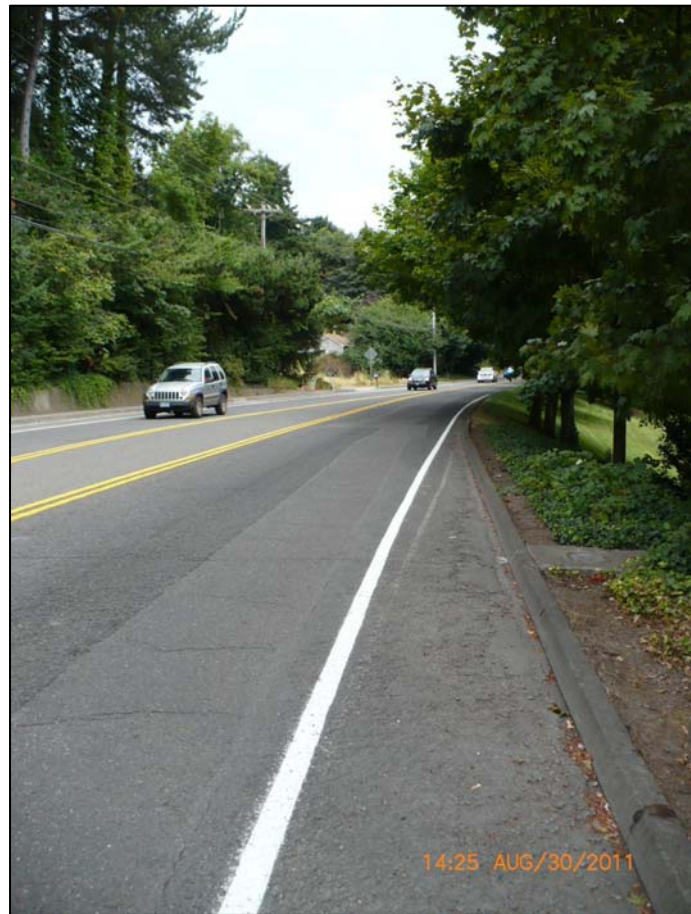
Barnes Road near Leahy Road looking east