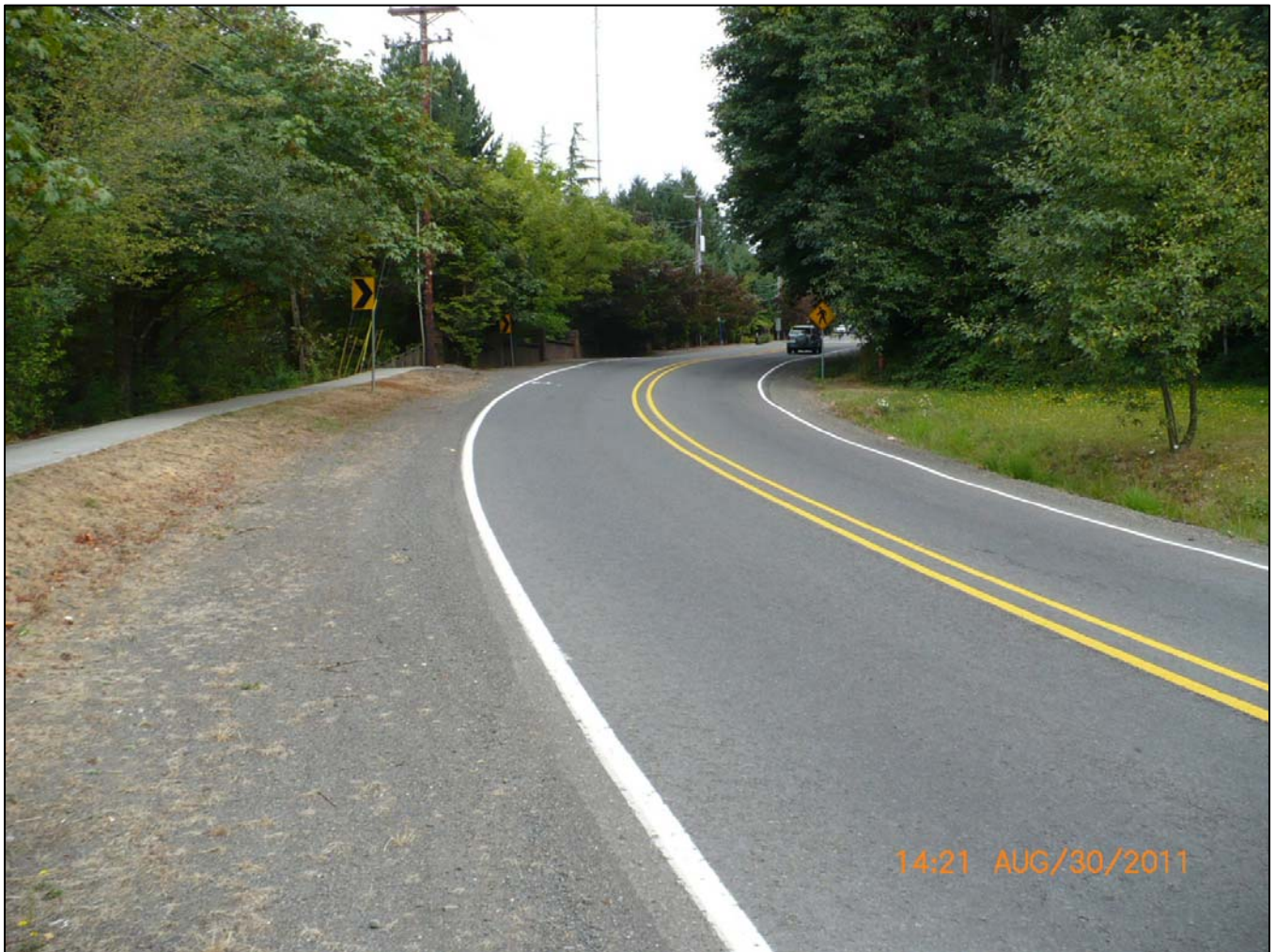
Barnes Road near Teufel Street looking east