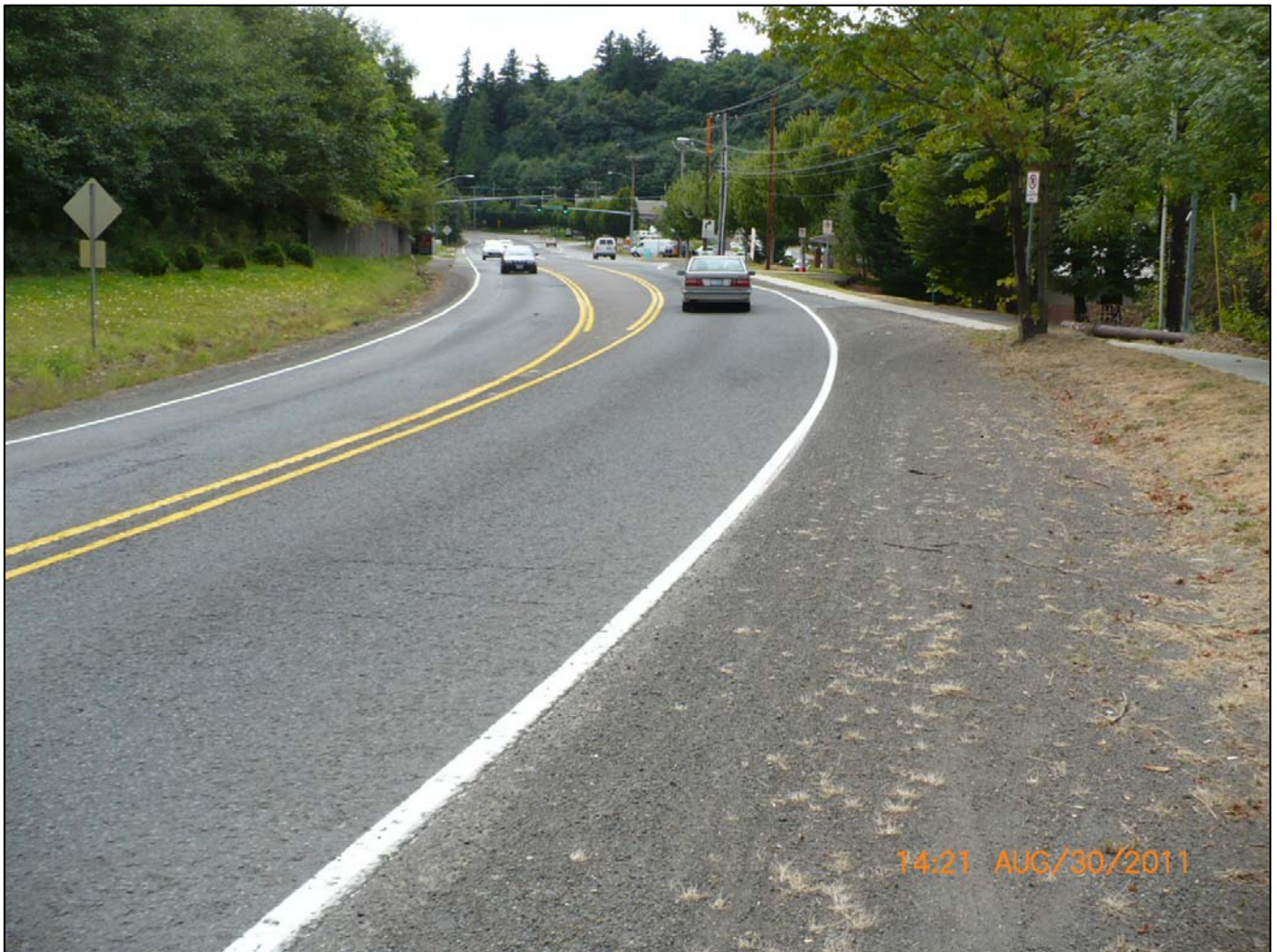
Barnes Road near Teufel Street looking west