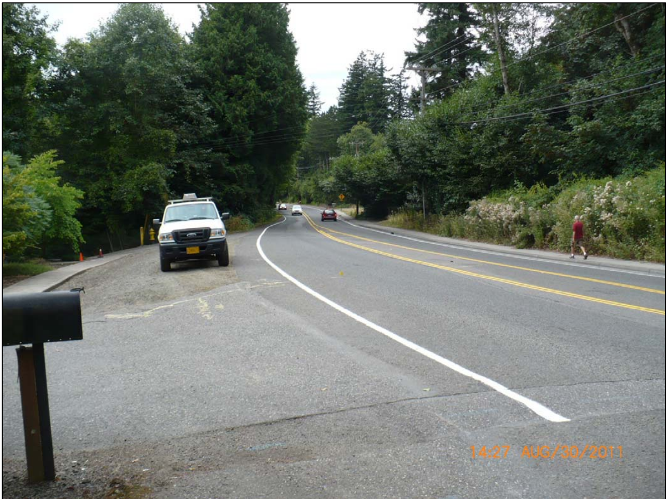
Barnes Road between Leahy and Miller looking west