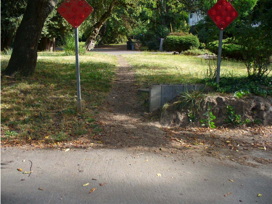
Proposed pathway location at Clarion Street facing north