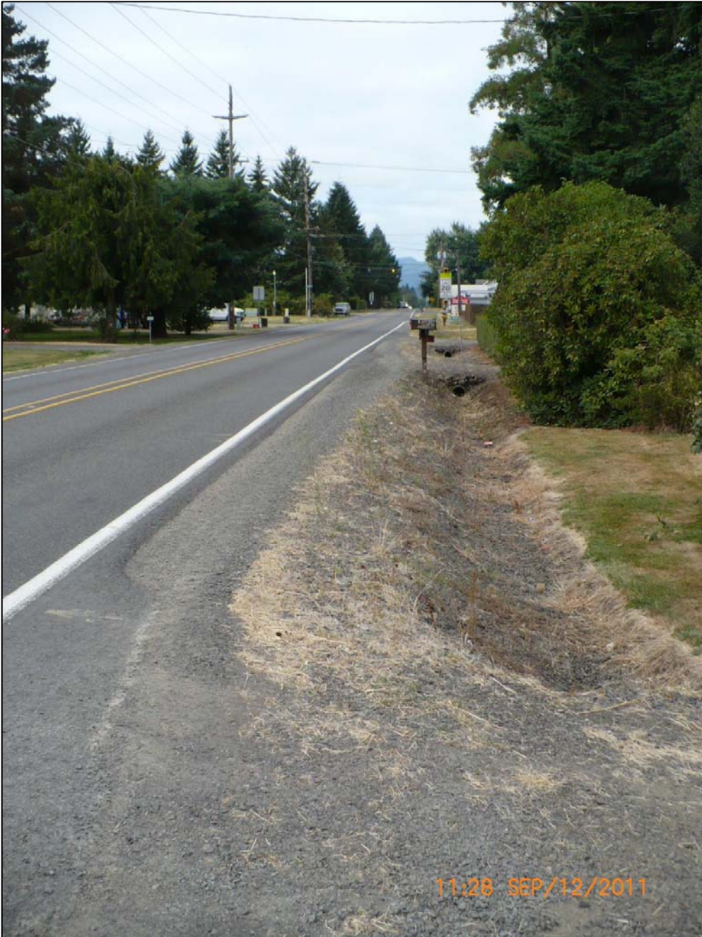
Verboort Road east of Visitation Road looking west