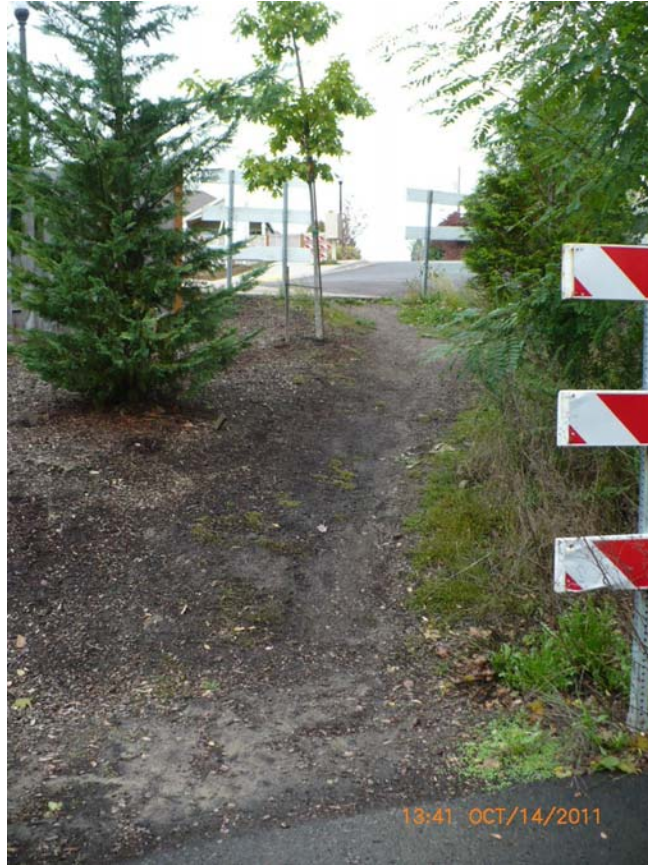
Proposed pathway location, at 74th Avenue facing north