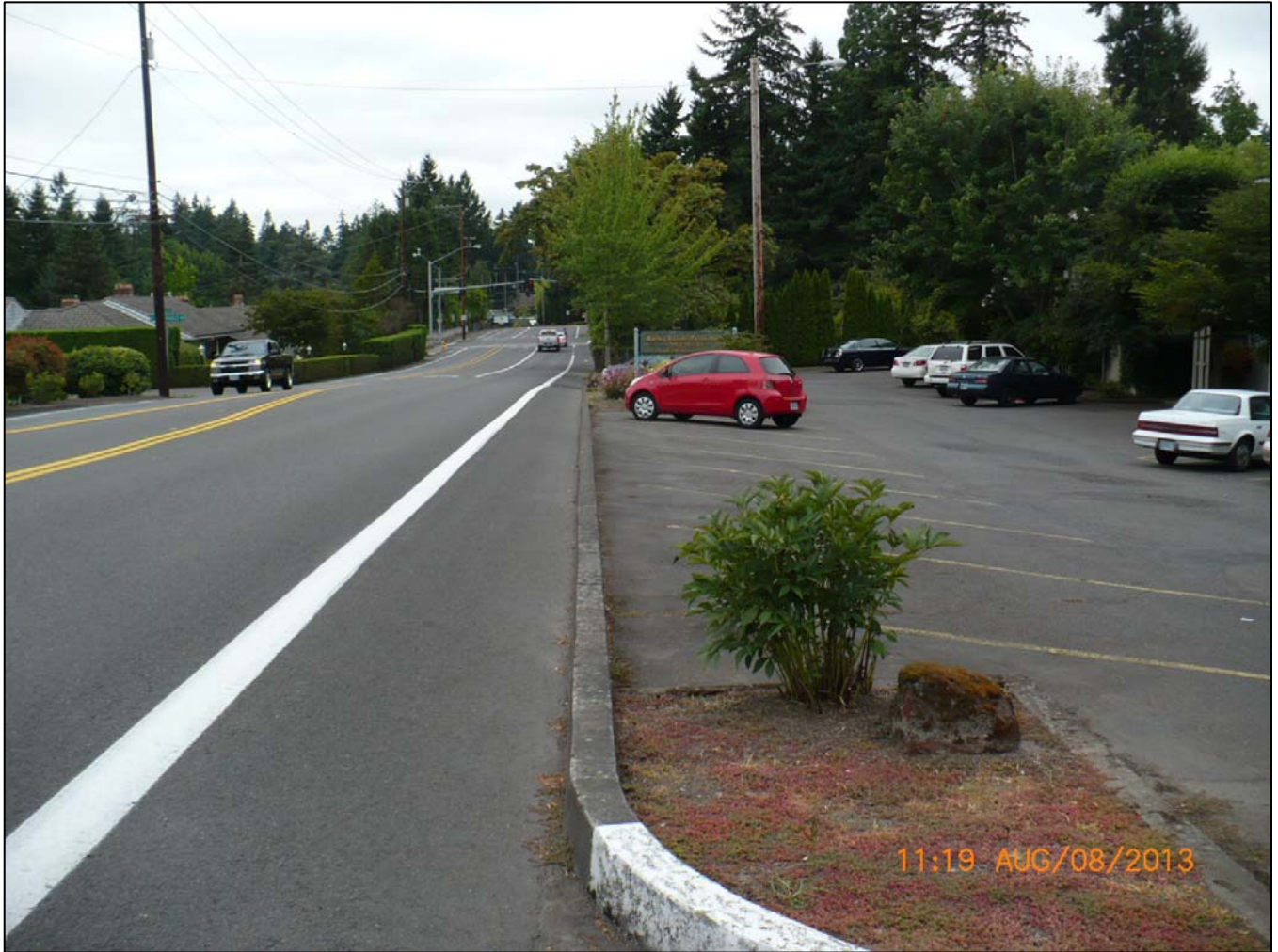
Scholls Ferry Road near Northvale Way looking west