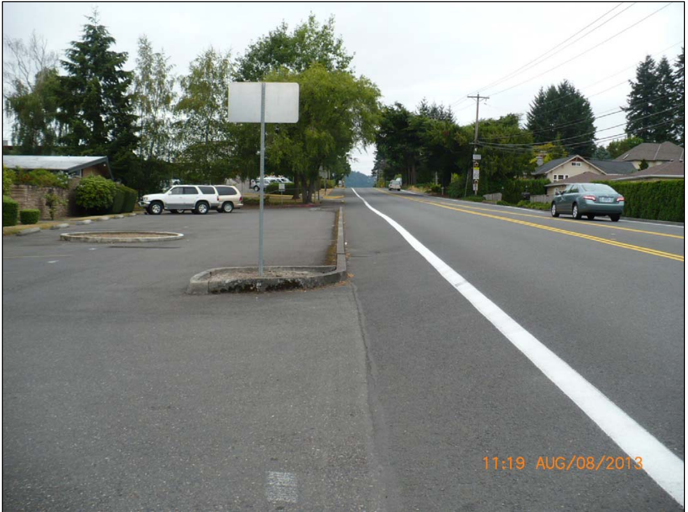
Scholls Ferry Road near Northvale Way looking east