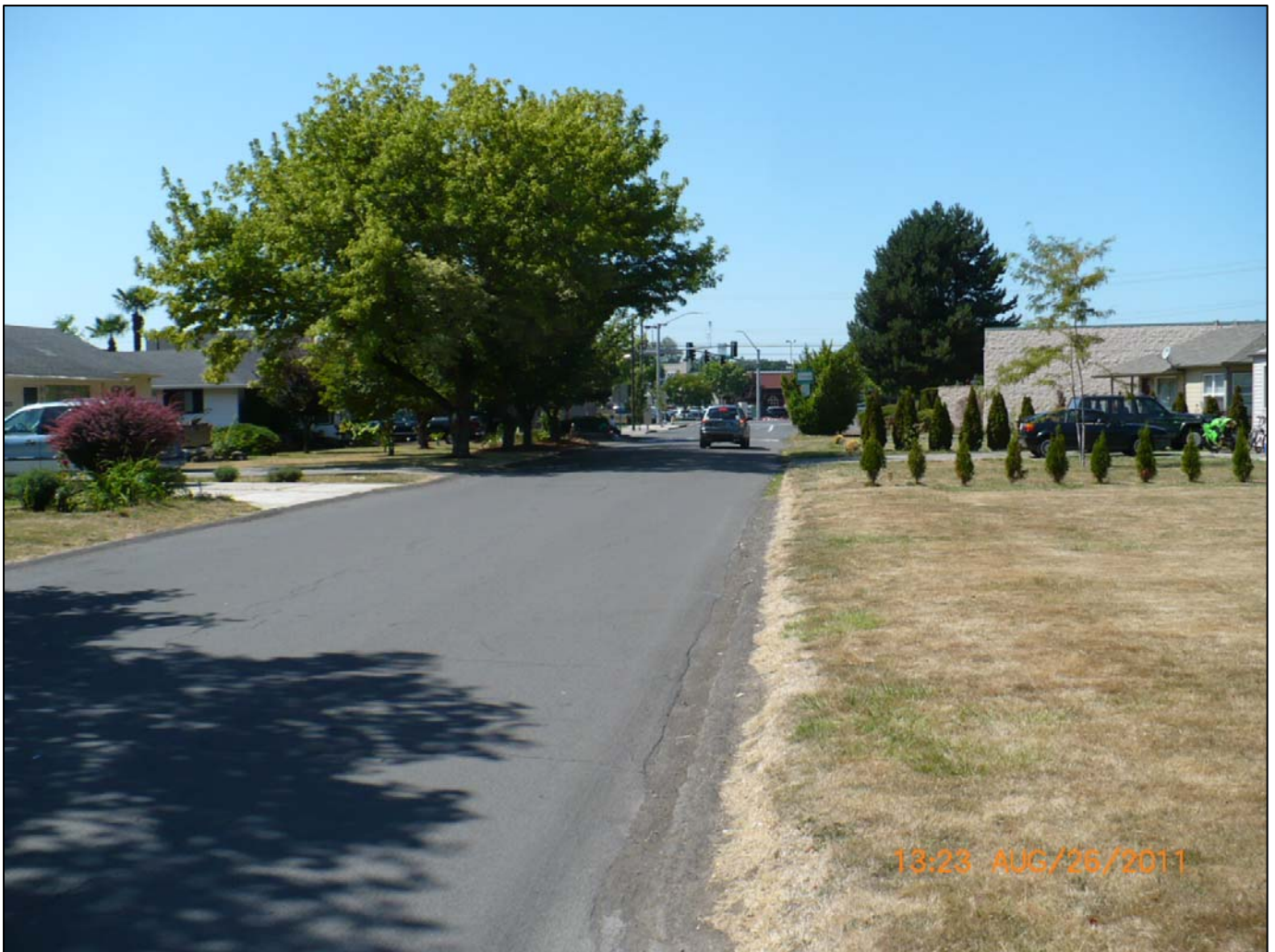
Fairfield Street facing Cedar Hills Blvd (west)