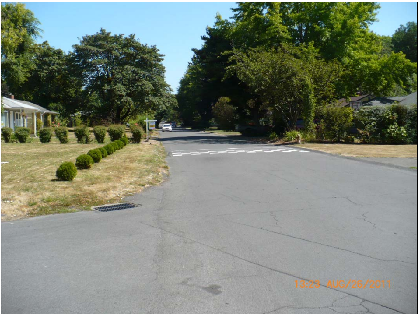
Fairfield Street facing east