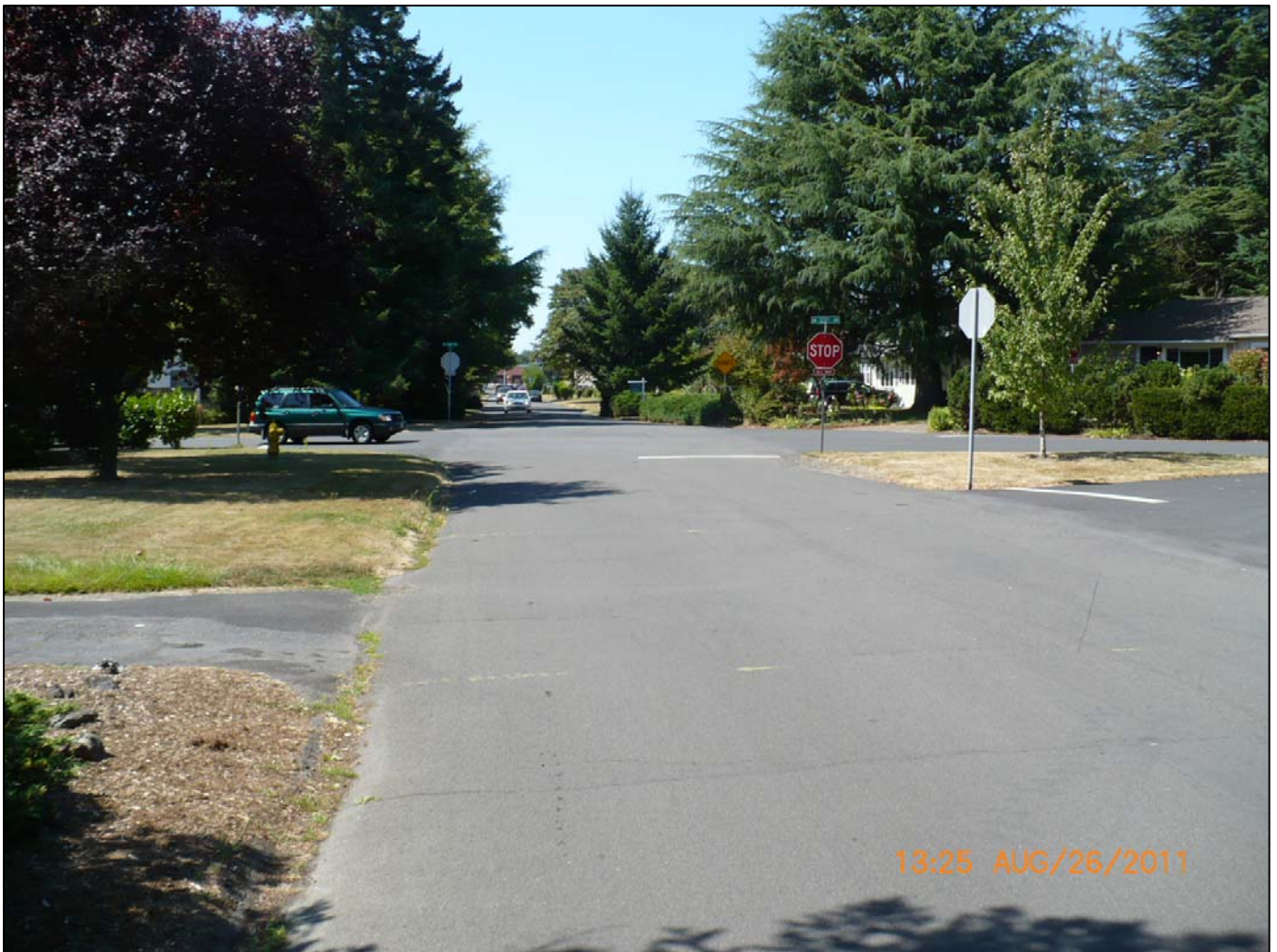
Fairfield Street near 124th Street facing west