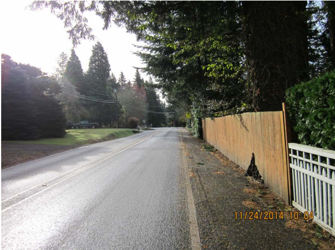
Proposed paved pathway location (left) at 90th Avenue and Morrison Street facing south