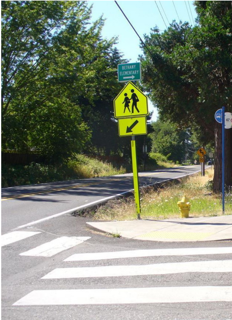
Proposed paved pathway location (left) at 174th and Bethany Elementary facing south