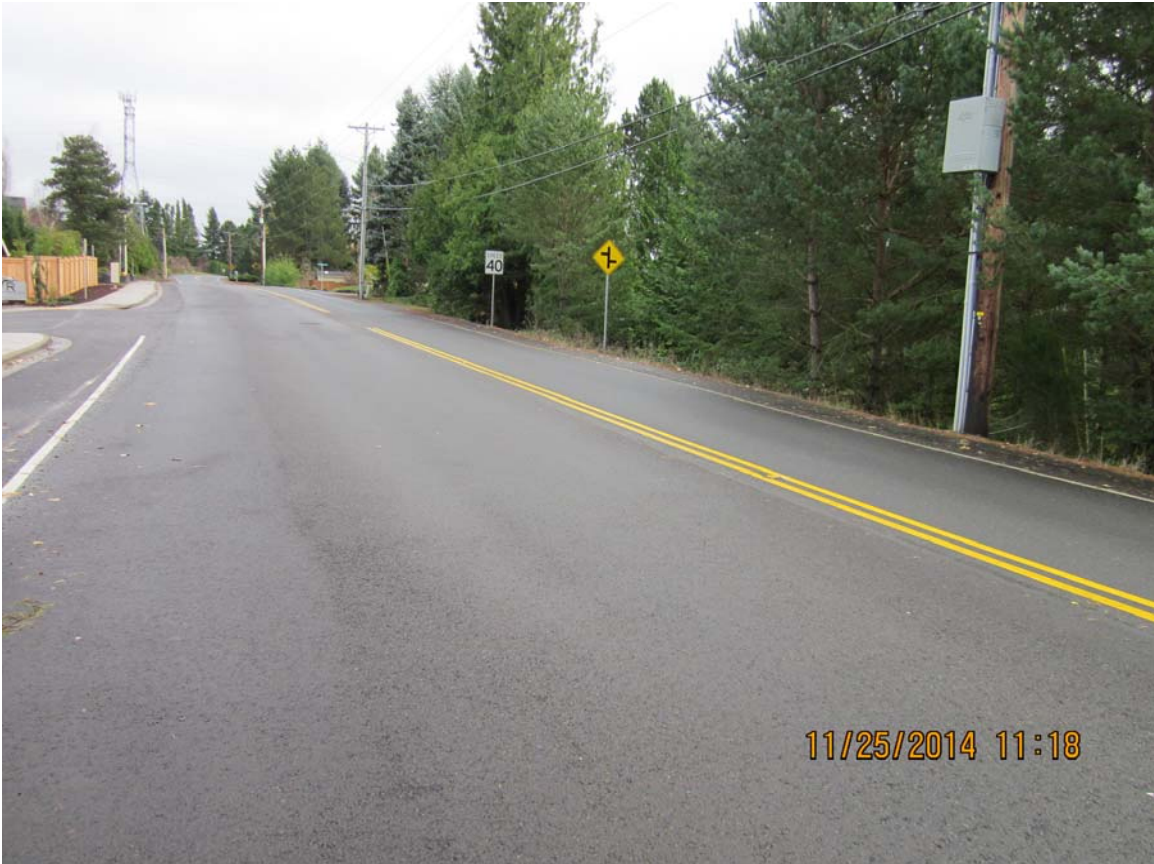
Existing sidewalk at Bull Mountain Road and Grandview Lane facing east