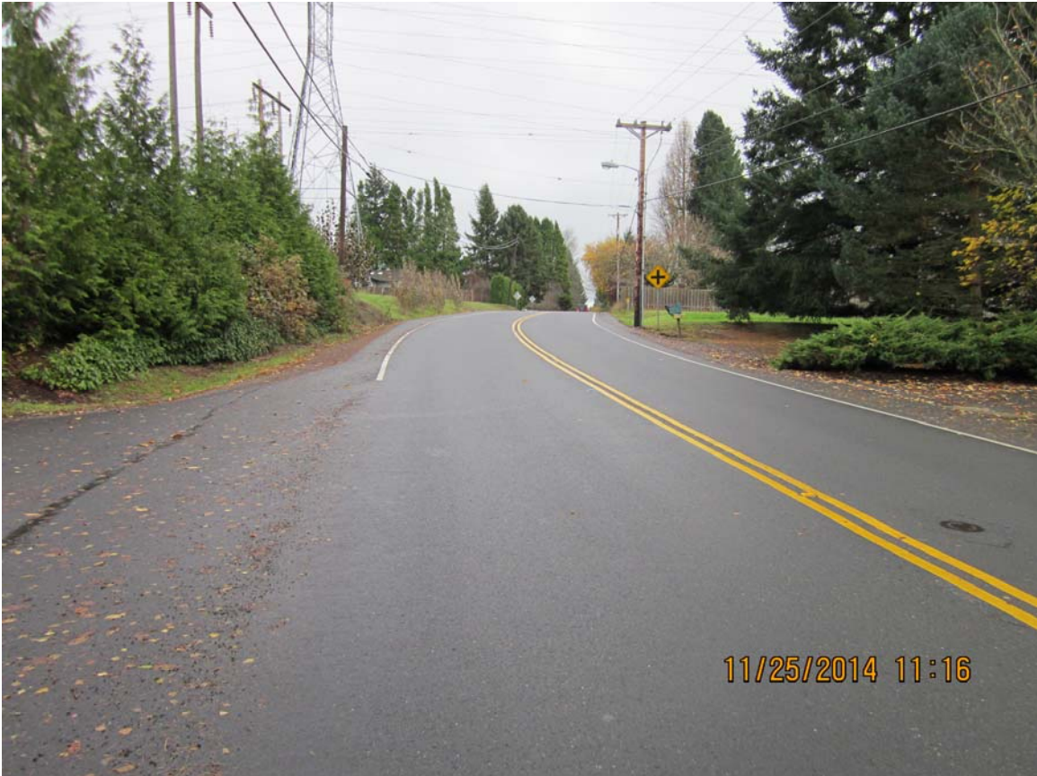
Proposed paved pathway location (left) at Bull Mountain Road and Conner Place facing east