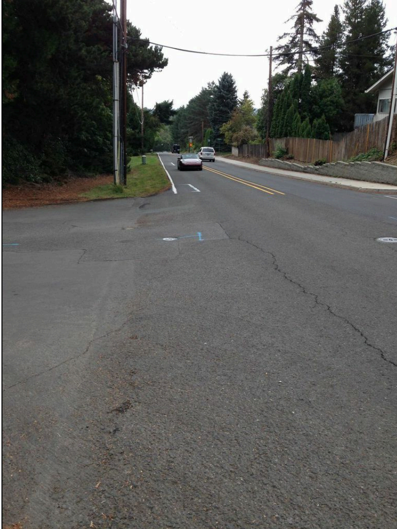
At intersection looking south