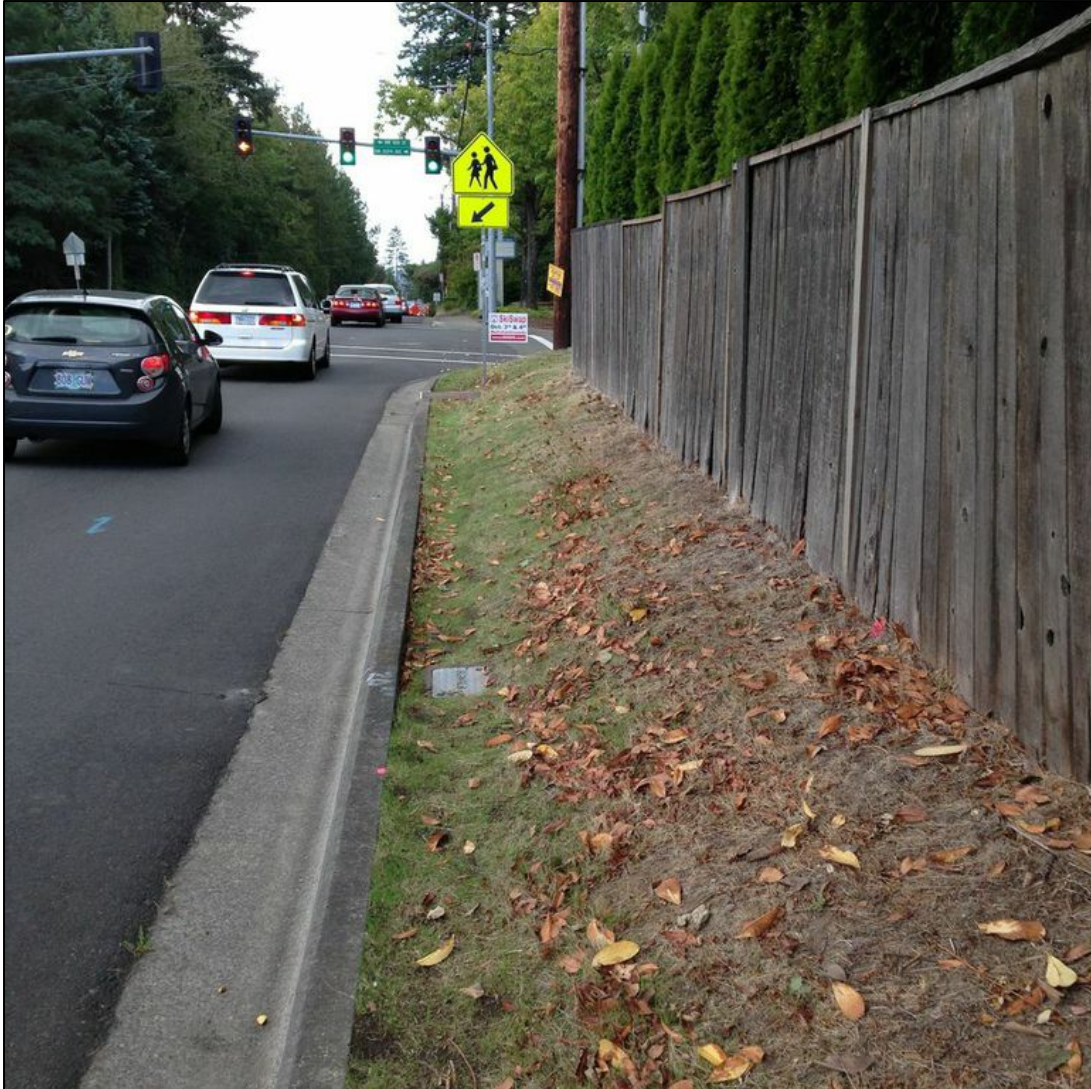
Cornell Road at 102nd Avenue looking west