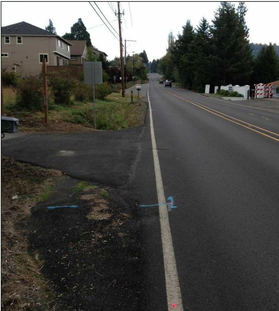
Cornell Road west of 97th Avenue looking east