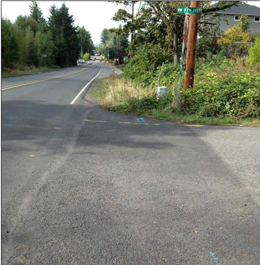
Cornell Road at 97th Avenue looking west