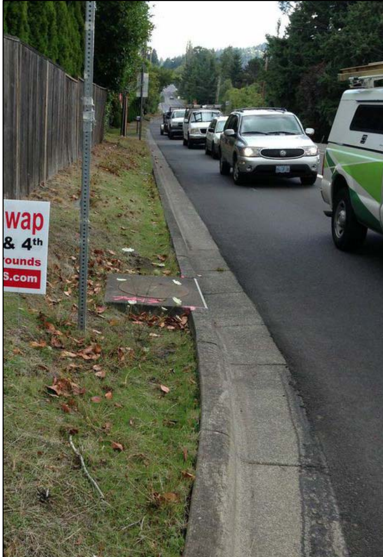
Cornell Road at 102nd Avenue looking east